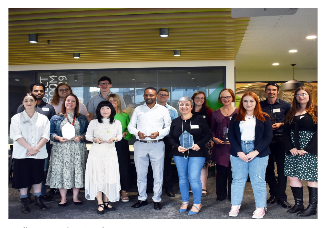
Excellence in Teaching Awards