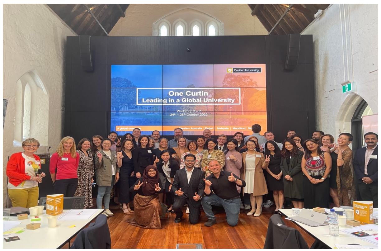
One Curtin Global Leadership Panel