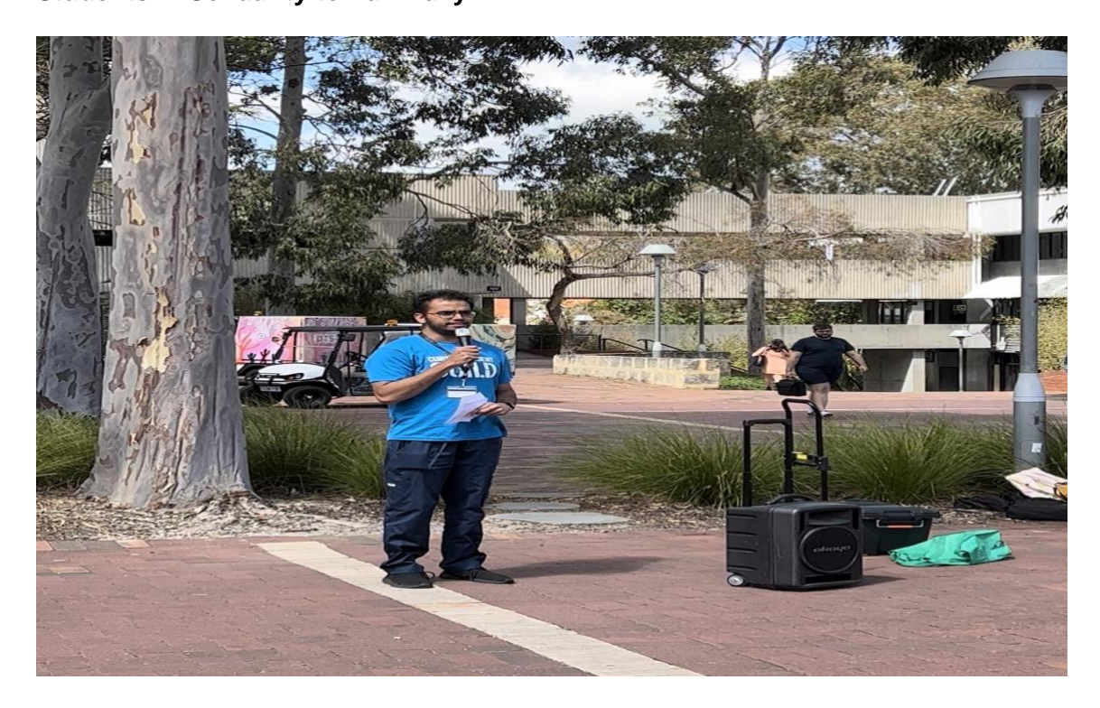
Self-Caring Circle #self-care