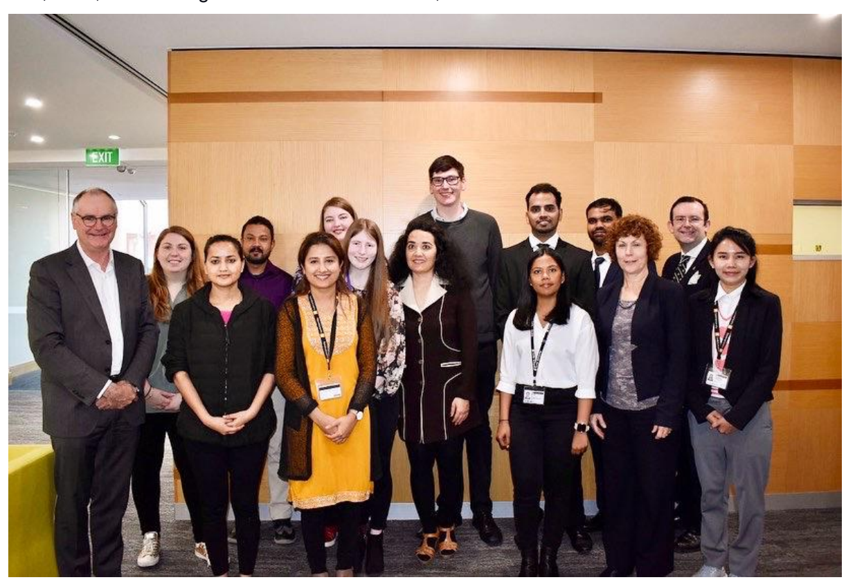
Lunch with DVCR, September 2022

ISC, PSC, VP-E along with other HDR students, had a casual lunch meet with DVCR.