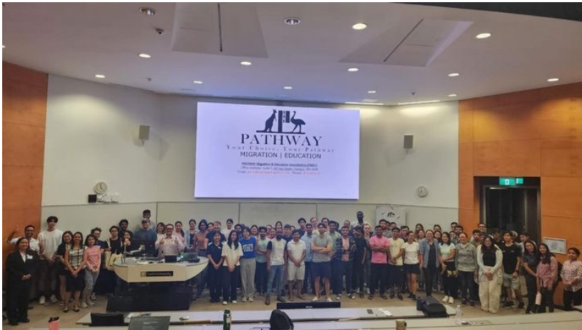
International Student Migration Awareness Plan