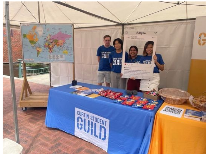
ISC stall at orientation