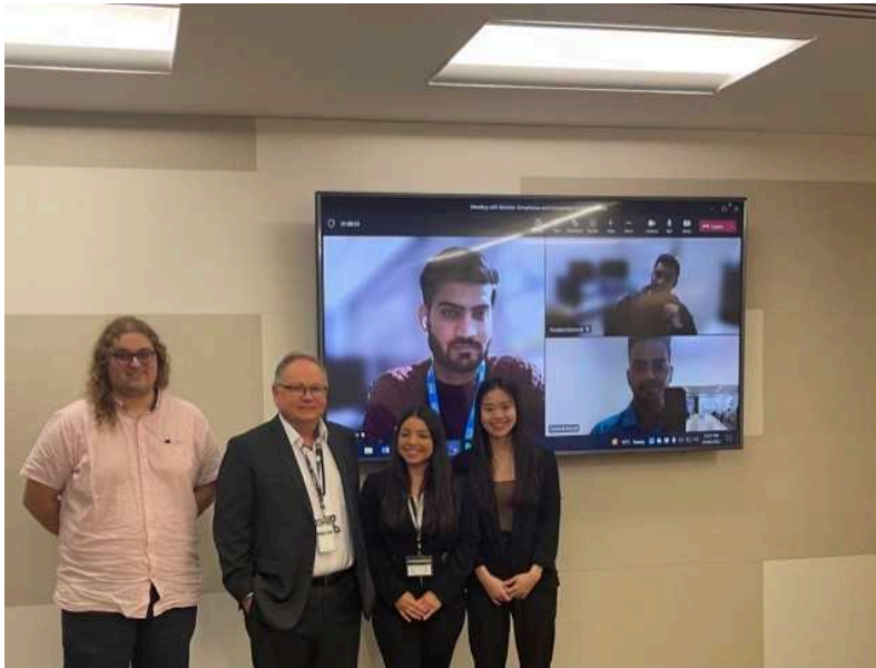
Meeting with Minister Templeman, June 2022.