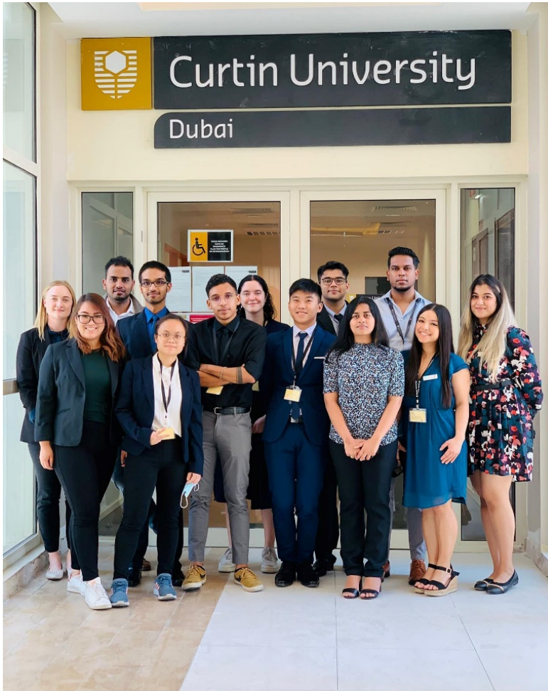
Student leader summit, June 2022, Curtin Dubai.