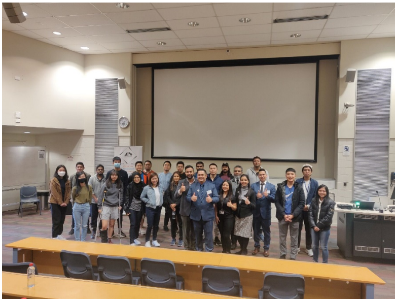
Migration workshop, June 2022.

Updates: The Migration workshop was successful and ISC will held a second workshop in August.